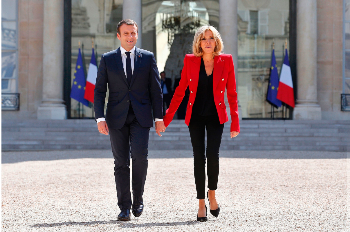
Emmanuel and Brigitte Macron

In Macron's chart, the Moon rules the 7th house of partnership. The current French president is iconoclastic for many reasons, and most often remarked is the marriage to his high-school French teacher, Brigitte Macron, 25 years his senior. The French are accustomed to the interesting and glamorous love-lives of their presidents, but even for them news of a younger man with an older woman (rather than an older man with a younger woman) immediately became a fascinating, obsessive detail. It is a relationship (7th house) with a woman who is old enough to be his mother (Moon), shocking and intriguing the public (opposition to Uranus) because of their difference in age and also because of the details of the romance; they met when Macron was 16, and Brigitte left her family of 3 children and followed the young man to Paris when he moved there for university at the age of 18.