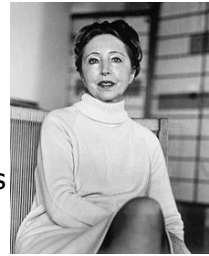
Chart data: February 21, 1903, 8:25pm. Paris, France.

Anïs Nin was a writer, most well-known for her explicit diarising of sexual pursuits. She also had several marriages. Some that were concurrent! "I reserve the right to love many different people at once, and to change my prince often," wrote Nin. Venus rules the Parisian writer's Ascendant, but is placed in the 6th whole-sign; this powerful Venus drove her, formed part of her 'work', but one might say that it also created unhealthy habits and situations. A Mars in Libra in the 1st also added to the equation.