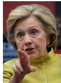
Chart data: October 26, 1947. Time unknown. Chicago, Illinois. (DD)

We do not know Hilary Clinton's birth time, but her Venus in Scorpio (among other chart elements) corresponds to her career in politics; powerful relationships!. Clinton has often been criticised for not being perceived as 'trustworthy', particularly by other women. Clinton's Venus gives her an understanding of motivations, but does not lend itself to easily connecting with others. Trust and openness for this Venus must be earned, and even then you have to keep proving yourself!